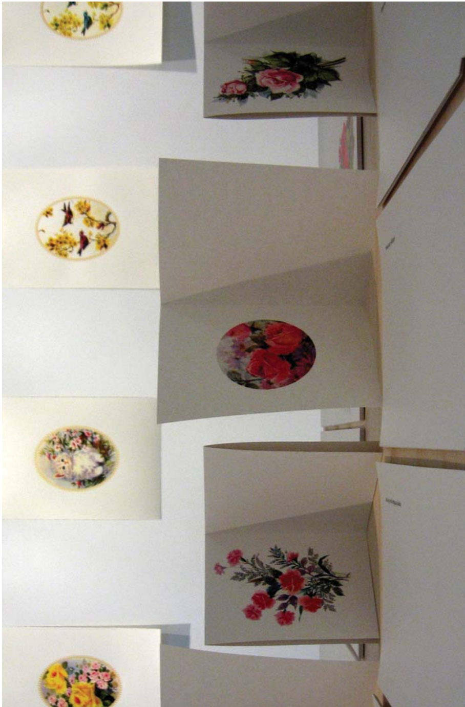
Best Wishes Nora Gee exhibition, Projectspace B431. Auckland: Elam School of Fine Arts, April 2010.