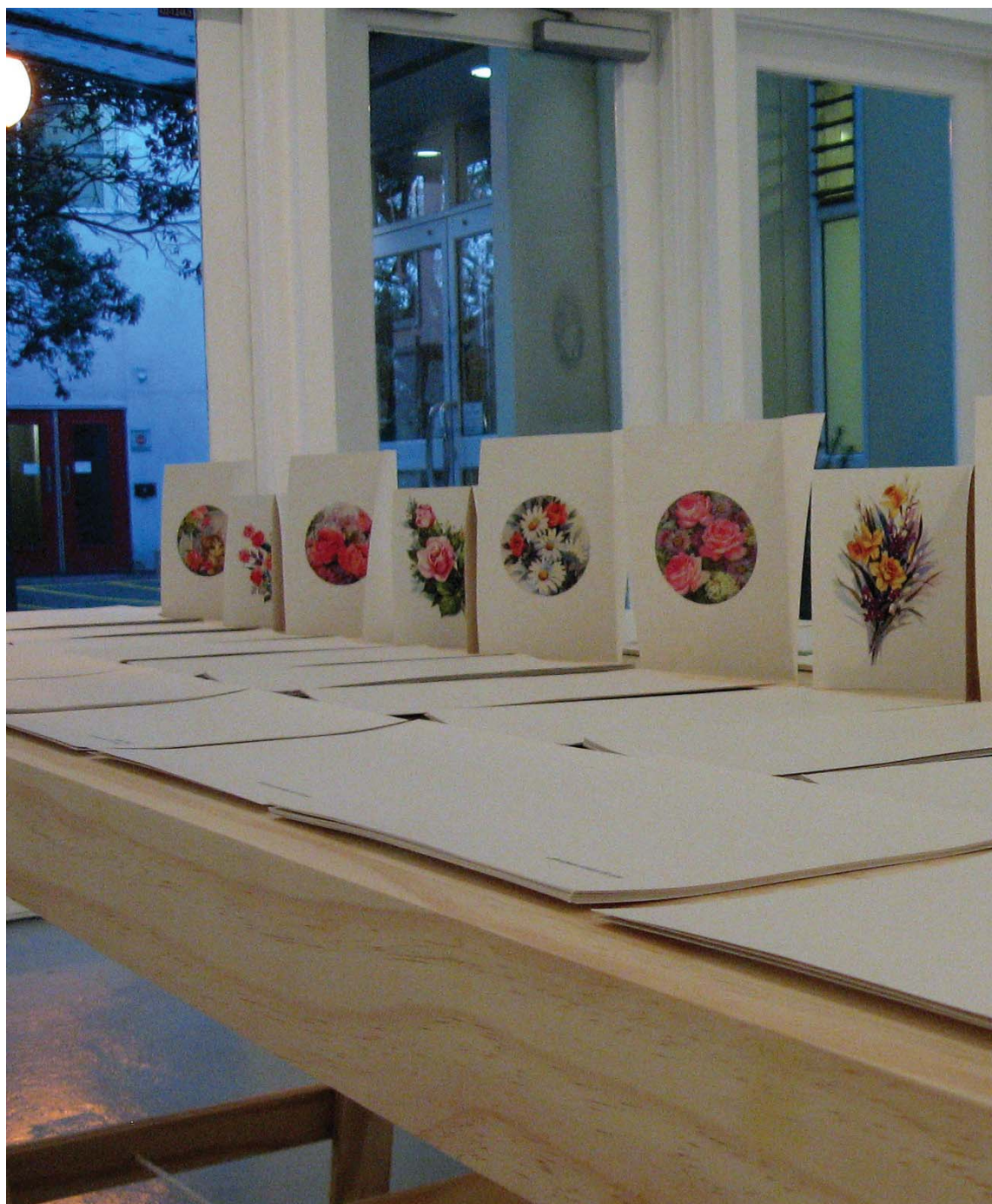
Best Wishes Nora Gee exhibition, Projectspace B431. Auckland: Elam School of Fine Arts, April 2010.